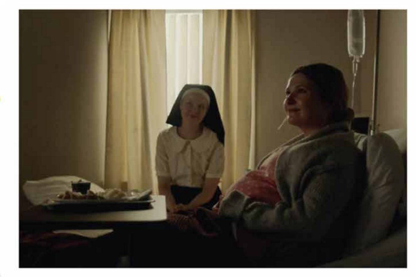
Abigail Breslin and Kasia Pilewicz in the film "Magda" about abortion law in Poland

Abyral Bretin in the film 'Maprix' about aborton kive in Polanci